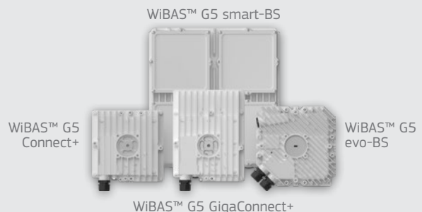
WiBAS™ G5 smart-BS